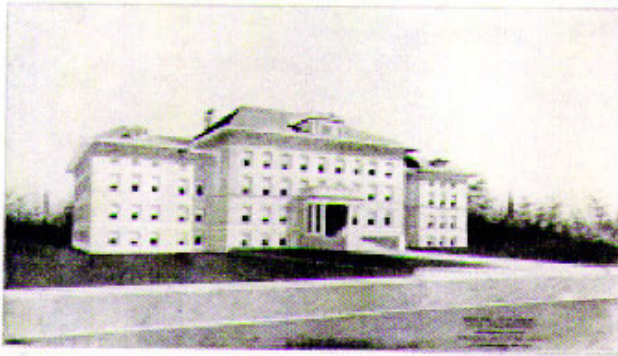
WORTHINGTON BUILDING IN DEPARTMENT OF BUSINESS