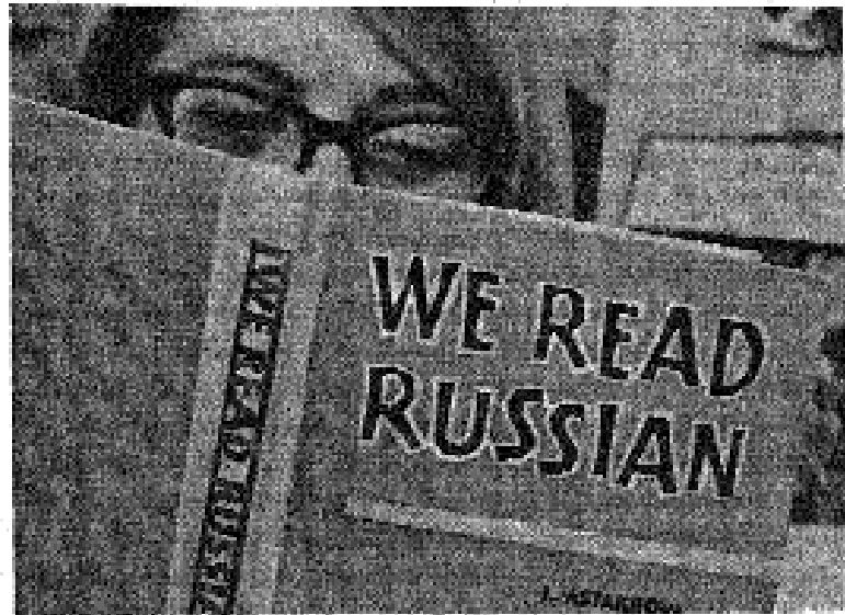
A Russian House resident hedges up on her grammar for the weekly conversation hour.

Ohio University ranks high with four language houses, Ohio State, nearby trips this year, had only two houses for development in language, a German house resident told.