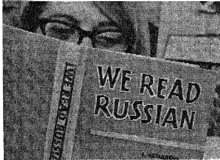
A Russian House resident hedges up on her grammar for the weekly conversation hour.

Ohio University ranks high with four language houses. Ohio State, nearby triple this year, has only two houses for development in language, a German house resident told.