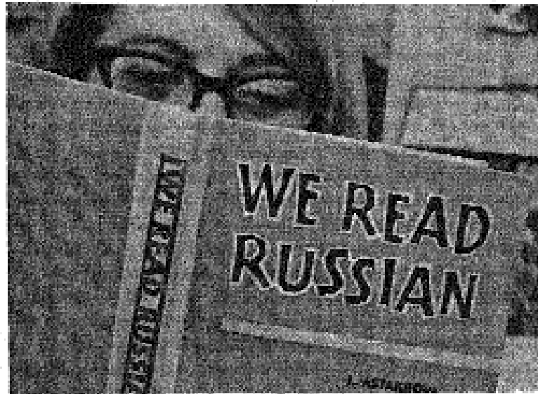
A Russian House resident hedges up on her grammar for the weekly conversation hour.

Ohio University ranks high with four language houses, Ohio State, nearby trips this year, had only two houses for development in language, a German house resident told.